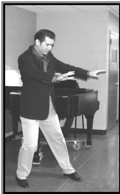
LOS

He further noted that one reviewer has characterized the book "as fine a masquerade of children's literature as was ever created".