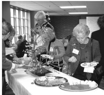
A delicious spread was laid out for the reception by Bravo Committee members.

Community support for the UK Opera program contributes to its success .