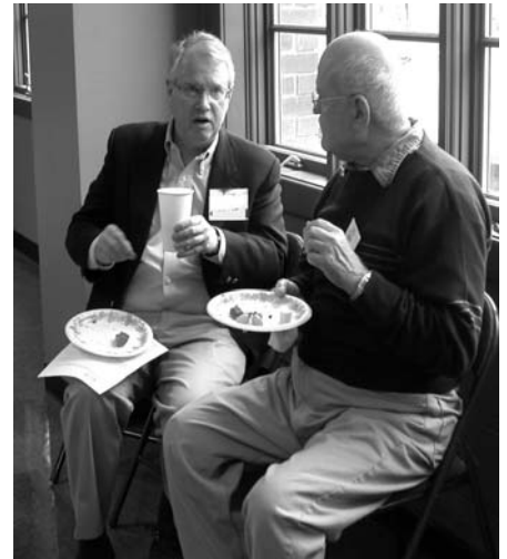
The reception was a good opportunity for Bravo Committee members to become acquainted and discuss their favorite operas.

Bravo Society members joined Lexington Opera Society board members for an afternoon reception at the "K-House" (home of the UK Opera Theatre) to catch a preview of the upcoming production of The Little Prince and learn more about the "town and gown" partnership between LOS and UKOT.