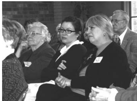
The music preview for the Little Prince had a profound effect on the audience.