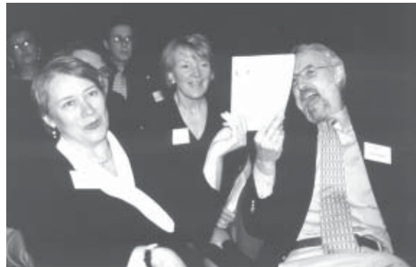
Scenes from last years Prelude Party