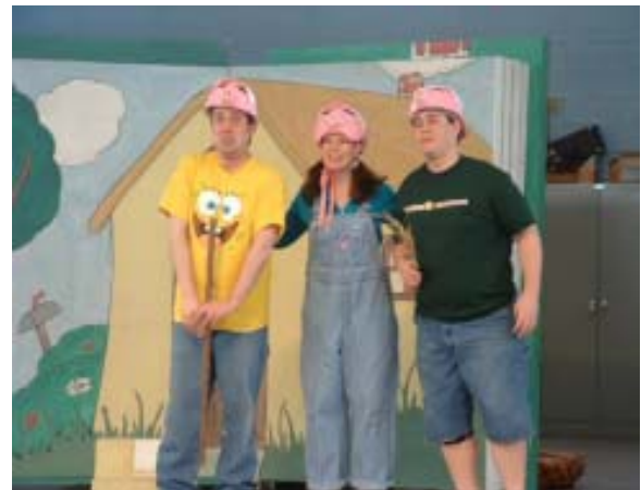
Three Little Pigs - The Opera Music by Mozart - see December 2002 LOS Newsletter to find out how to bring this produc- tion to your child's school!